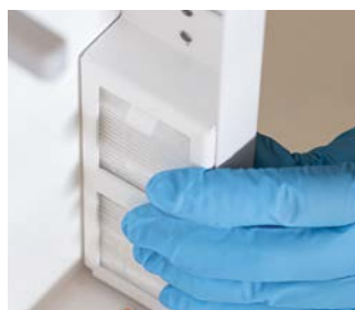
Minimize exposure to particulates and air-borne contaminants with forced air circulation and replaceable HEPA filters.