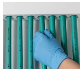
Medical grade silicone gently secures dilators vertically which keeps lumens clean.