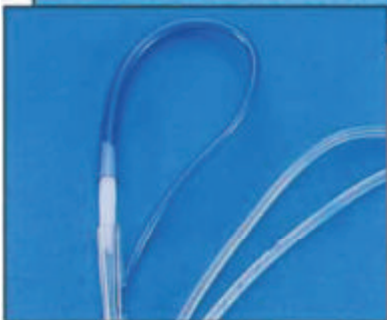
Blue side arm caps to 5-in-1 connector when not in use, reducing reflux accidents