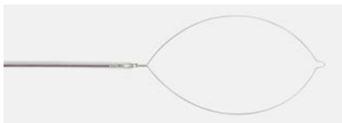
True-to-size geometry of the snare designed to realize full intended size and maintain shape integrity after one or more deployments.