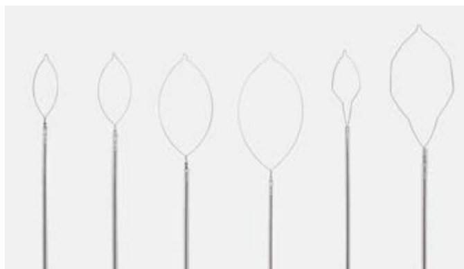
Multiple shapes and sizes to accommodate both hot and cold polypectomy.